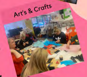
Art's & Crafts