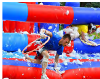
Fame JR - Summer Musical The MAC £7 per ticket

Children can enjoy free activities including: face-painting, balloon-modelling, summer crafts, lawn games, bouncy castles and walkabout entertainers.