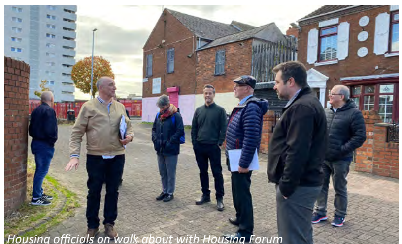
Housing officials on walk about with Housing Forum

The effects of the pandemic are still causing mayhem and the H.E. are only recently able to tackle the backlog of schemes which has built up. The cladding scheme for Grainne House was to begin in the financial year 2023 but unfortunately has had to be postponed